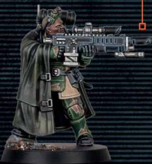
Hot-shot marksman rifle